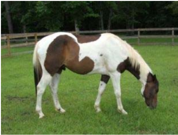
DILLON, BEHS #081

Did you know that the name “Dillon” means “faithful”? And that's easy to believe when you get to know this affectionate, attention-loving guy. When he was introduced to a new BEHS member, he quickly won her over and she decided right then and there that he was a keeper.