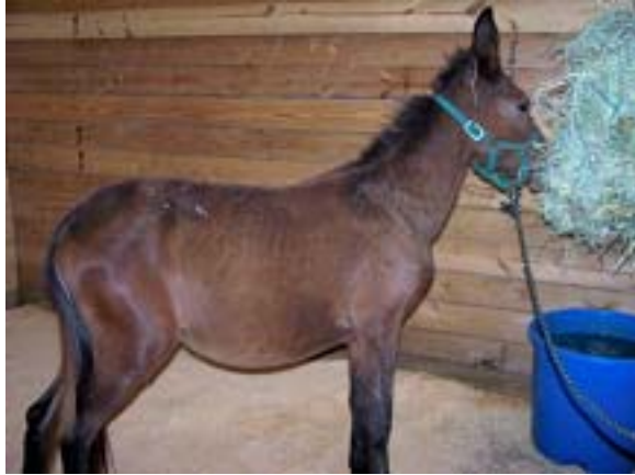
COCOA, BEHS #120

This April 2006 dark brown bay grade stud colt with two white socks and a star came into BEHS when his owners released him. Thanks to Bluebonnet, this boy will soon be sporting a healthy, shiny, gorgeous coat the color of which will be the envy of every horse in town.